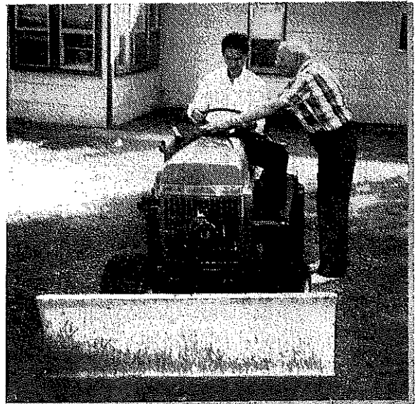
Showing off the John Deere Garden Tractor