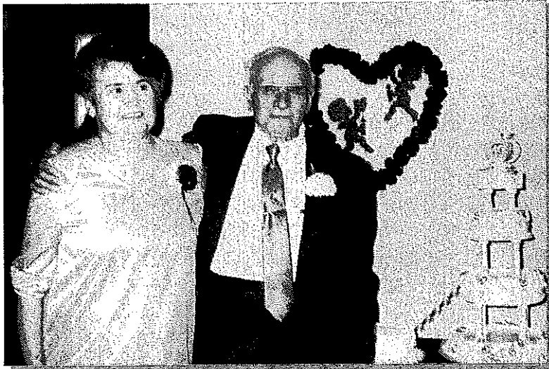
The Rayls at their 40th Wedding Anniversary